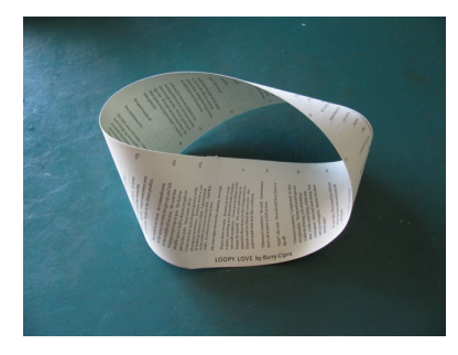
FIGURE 1. A story without beginning or ending, written on a Möbius strip

Barry Cipra presented a short story written—literally—on a Möbius strip (see Figure 1). The idea was to experiment with integrating the mathematical properties of the Möbius strip into the structure of a story. The Möbius strip's endlessly looping nature and the twist that turns the surface's two sides into one suggested, to him, a story about an ongoing love/hate relationship, with no beginning, no middle, and no end, that switches points of view back and forth between the two narrators. This form is also an experiment in the kinesthetic experience of reading: "scrolling" a Mobius strip is a novel tactile sensation that surely influences the reader's reaction to what's written on it.